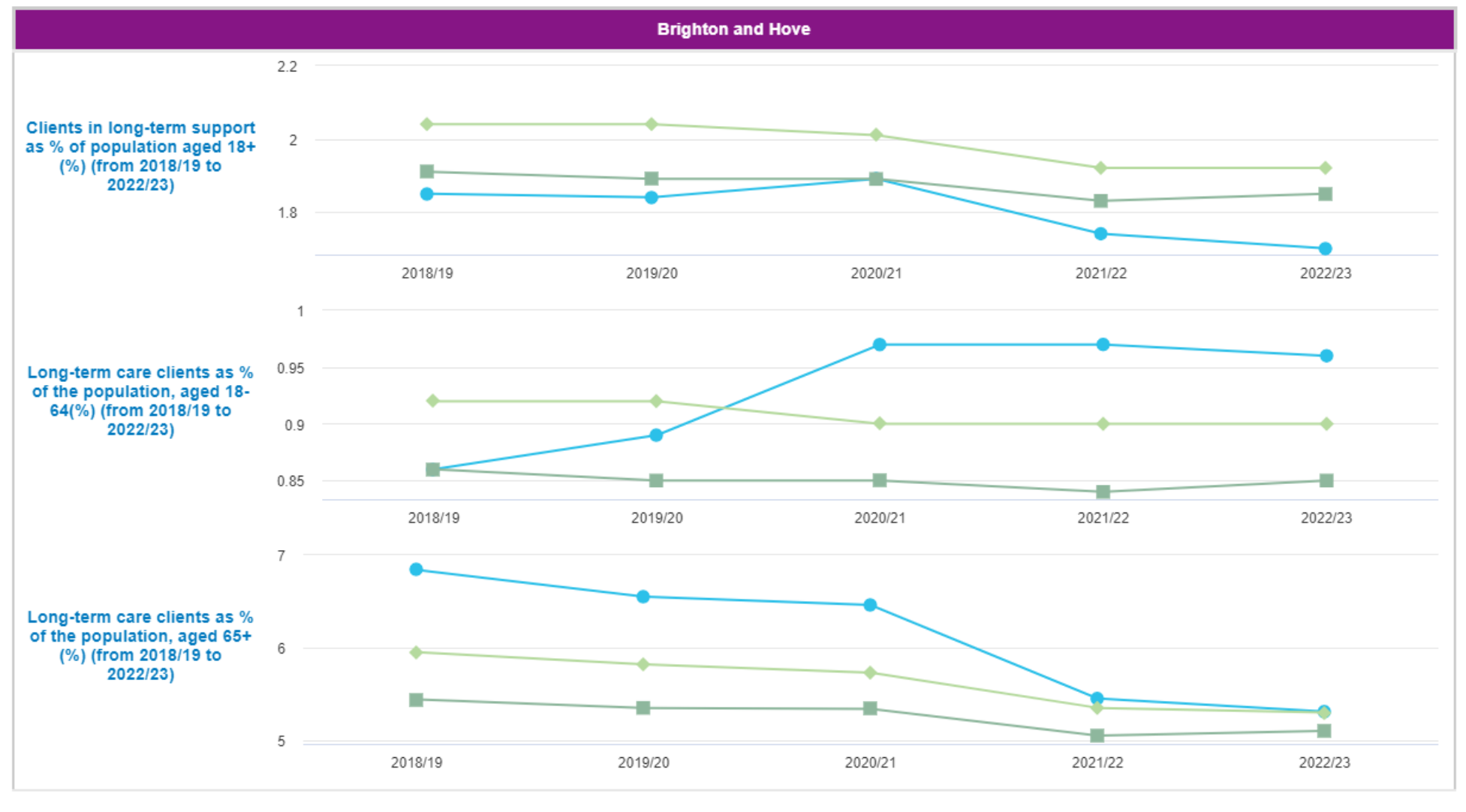
Clients in long-term support as a per cent of the population, by age for Brighton and Hove